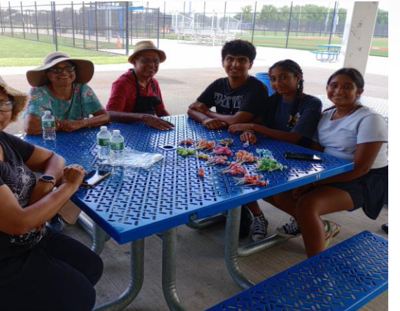
THE LONG ISLAND MAR THOMA CHURCH