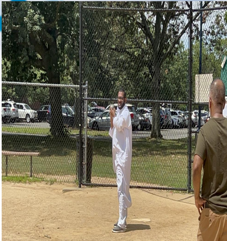
THE LONG ISLAND MAR THOMA CHURCH