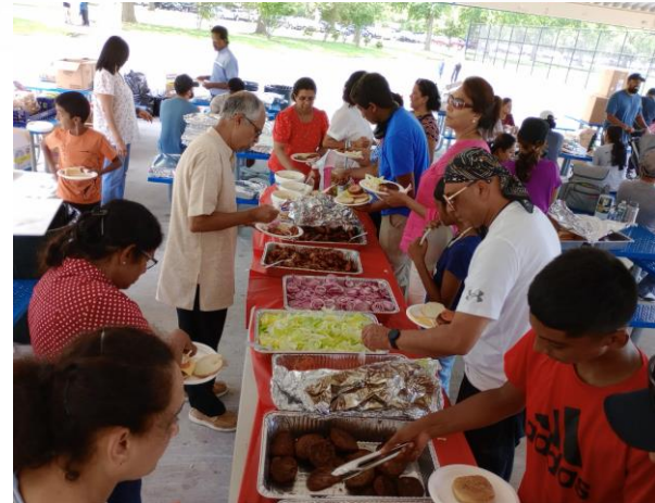
THE LONG ISLAND MAR THOMA CHURCH