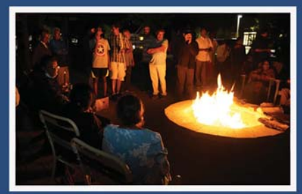
FAMILY RETREAT - 2022